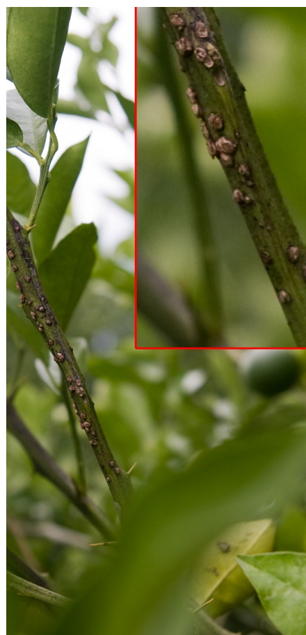
Figure 3. Twig lesions with an inset of some blister-like lesions at a higher magnification.

All aboveground tissues of citrus are susceptible to canker. Symptoms appear most often on the fruit, leaves, and twigs of infected plants (Figs. 1-7). Leaf and fruit symptoms typically start as small, blister-like lesions that expand as they age (Figs.