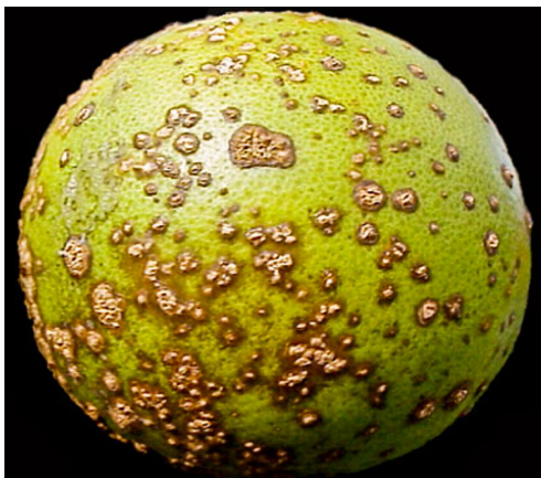
Figure 5. Raised, brown canker lesions on fruit with particularly prominent water soaked margins.

Further information about citrus canker can be found at http://canker.ifas.ufl.edu and http://www.doacs.state.fl.us/pi/canker/ .