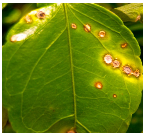
Figure 6. Raised, brown canker lesions on leaf.