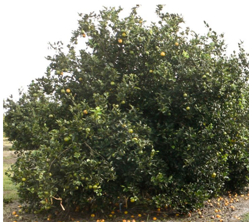
Figure 7. Fruit drop caused by citrus canker on a 'Hamlin' sweet orange tree.