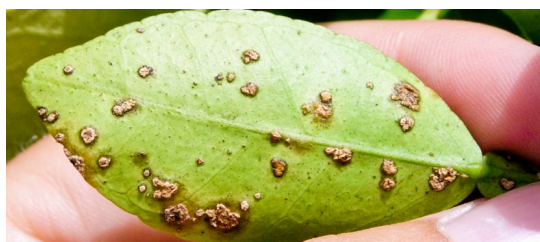
Figure 2. Round, raised blister-like lesions with water soaked margins with examples highlighted by the arrow heads.

The most recent outbreak of citrus canker was discovered in September 1995 on residential citrus near the Miami International Airport in Miami-Dade County. Despite an attempted third eradication of the disease, the hurricanes of 2004-2005 spread the disease from 10 counties to 25 where the disease is present today. During the initial eradication process, 2.1 million commercial and dooryard trees were destroyed by 2003. In January 2006, the eradication program ended because the disease became so widespread that it was no longer feasible to continue the eradication efforts. As a result, the citrus industry is now learning to live with and manage citrus canker while continuing to produce quality fruit.