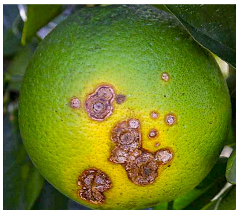
Figure 4. Close-up view of typical fruit lesions. The lesion margins are water soaked with a prominent yellow halo.

To reduce the potential movement of the bacterium from one tree to the next, simple rules of decontamination should be used when handling trees. Spread is most likely to occur when foliage is wet, so if possible, only work with citrus trees when they are dry. People and equipment should be decontaminated each time before handling a new tree. It is advisable to practice personal and equipment decontamination between trees. Hand and arm washing with soap and water, hot or cold, for a minimum of 20 seconds is needed to remove the bacterium from the skin.